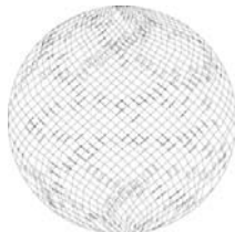
Orbitor 4 nozzle spray pattern